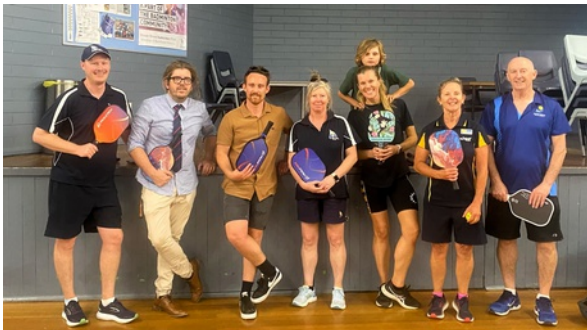
Bellarine College Staff