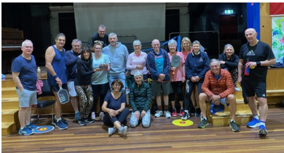
Advanced Pickleball group Leopold

Merry Christmas to everyone and thank you to Life Activities Geelong for your continued support.