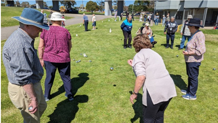
Even Bocce balls cast a shadow on a sunny day