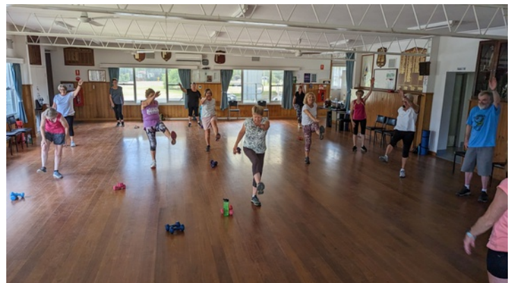
Exercisers in action earlier in the year