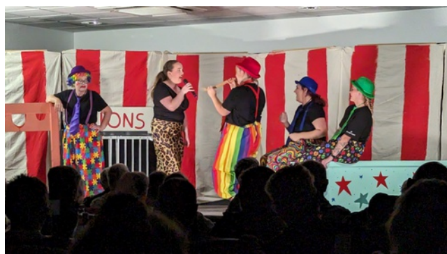
Pictures from the Winchelsea Dinner and Play called "Under The Big Top"