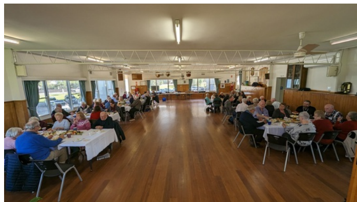
Mystery Lunch was an outstanding favourite for June's events