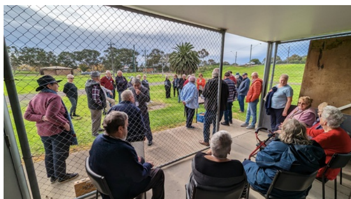
This was biggest field of Bocce players since before COVID waiting to hear their Score