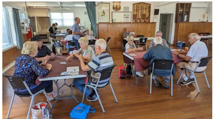
Card playing during Committee meeting moved the tables nearer the foyer