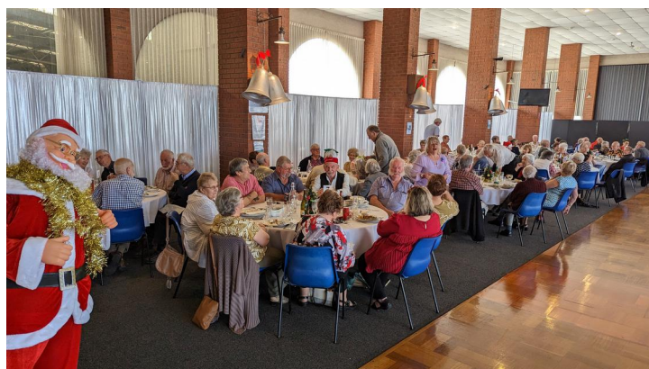
Club Christmas Lunch at Italian Club