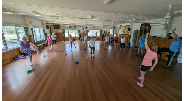
Exercisers in action