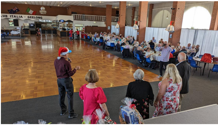
Drawing the free raffle prizes at the Christmas Do.