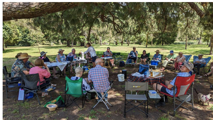
New Years day Picnic at Balyang Sanctuary