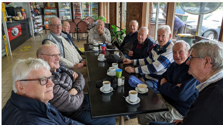
Typical Friday Walk for the Mens section

9:15 am. at car park opposite the RnR Cafe (old Big4) in Barrabool Rd..