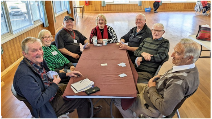
Looks like fun is Trumps at the 500 game card table.