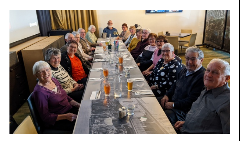
All the toilets in Geelong 's police stations have been stolen. The police have nothing to go on