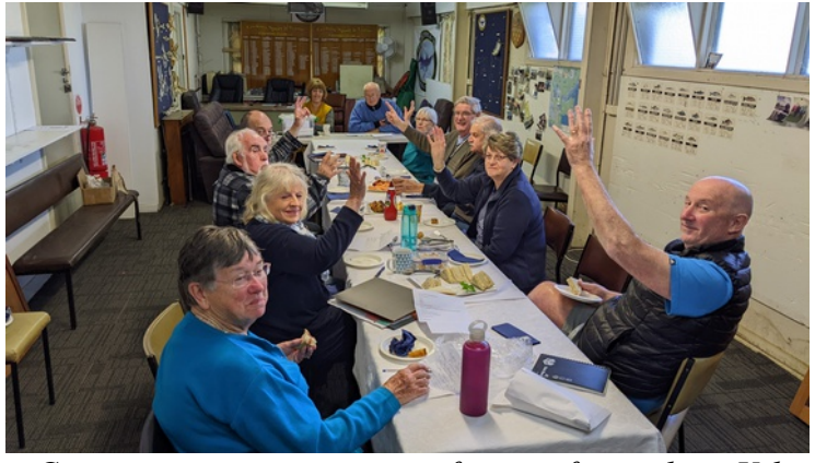
Convenors meeting voting in favour of something Val didn't like it seems