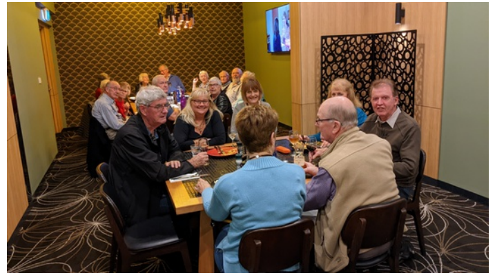
Dineout at Buckleys was a cosy Nook just right for us and was a great night.

Politicians and diapers have one thing in common. They should both be changed regularly, and for the same reason.