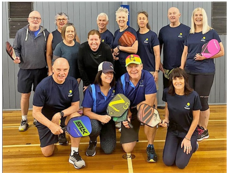
A gathering of Pickleballers.

Every Tuesday, those attending meet to practise and prepare for the games at Memorial Hall. Numbers are still