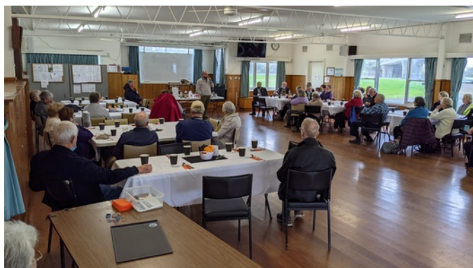
The Soup and Roll day was one event squeezed in and much appreciated. It also had a speaker on Recycling