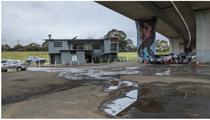
Car parking has been disrupted by the stream of COVID Testing cars using the site often filling the whole space in front of the Club