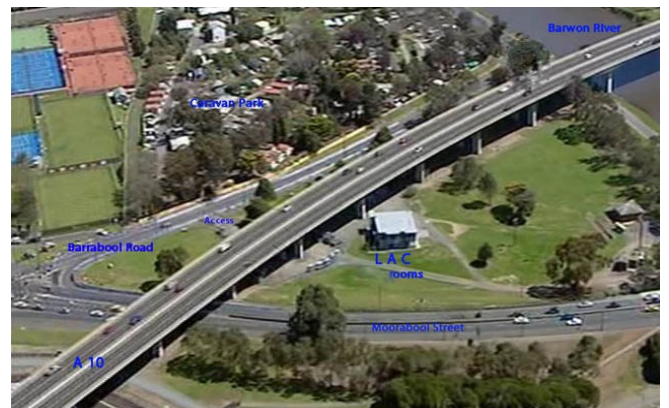
Best Club in Geelong and Best location

Membership Joining Forms and Committee Nomination forms are attached with the notice of AGM