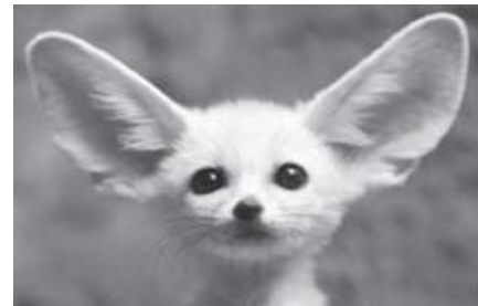
HAVE YOU HEARD