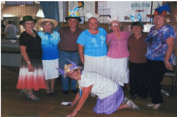
Arvo Tea is more than Dance

Thank you Dancers for your support and making our Arvo Tea Dance so successful.